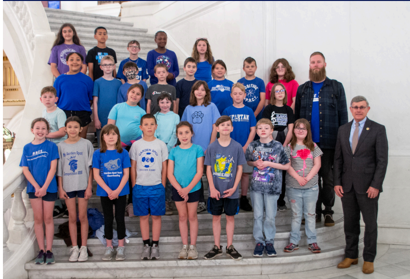
Students from Blue Ball Elementary School

One of my favorite opportunities as a state representative is providing school tours of the State Capitol to students in my district. This past school year, over 900 students and teachers visited the building that President Theodore Roosevelt called "The handsomest building I ever saw."