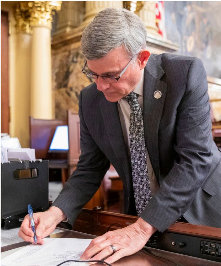
I'm pictured signing a discharge resolution to move election integrity legislation for a full House vote.

I will keep fighting for critical election integrity measures that restore confidence in our elections.